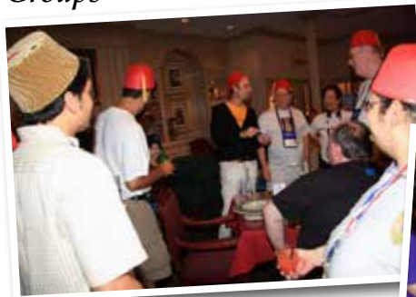
Total Confusion—New England's finest...