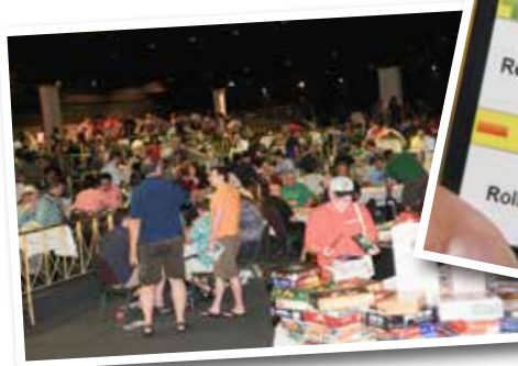
...Open Gaming & library going strong