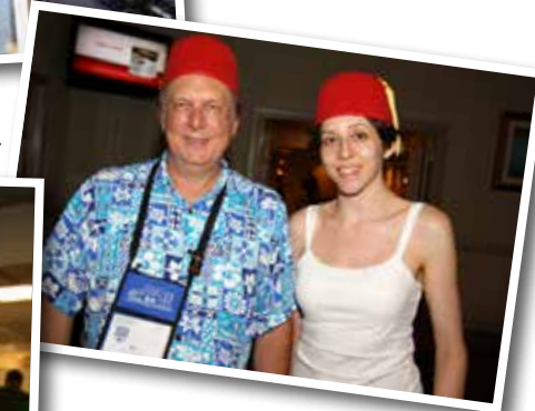
...standard English gentleman's chapeau in Morocco