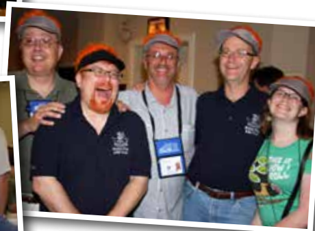
...call the History Channel— the Vikings have landed!