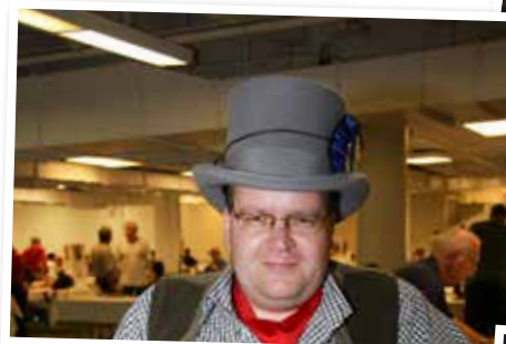
bad Revlon ad or Coleman wanna be's ...