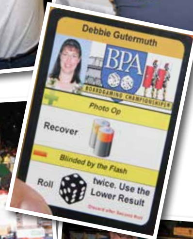
always something different in Open Gaming...