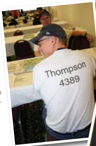
for the guy who is always forgetting his badge...