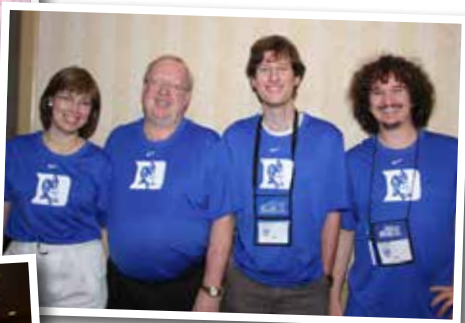
...Beauty and the Beasts—enuff said