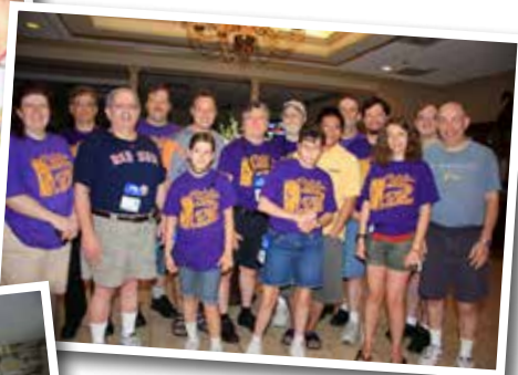
...Manly Men? or the Greenville Mafia getting in touch with their feminine side