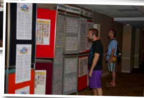
checking out past honorees...